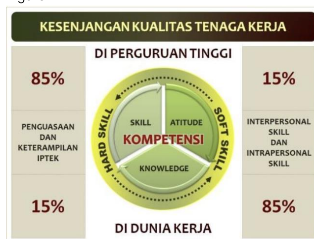
Figure 2 Workforce Quality Gap (Motivasi Usaha Universitas Esaunggul)

Despite efforts to improve soft skills through various initiatives, the 2020 ITB user study reveals that alumni soft skills are still relatively low. This study will use ITB as a case study to identify the best ways to develop soft skills for maximum impact. Research from Harvard University, Carnegie Foundation, and Stanford Research Center in the United States has shown that 85% of career success is due to soft skills, while hard skills account for only 15%. A 2009 study by Indonesia's Ministry of National Education found similar results. Moreover, Neff and Citrin (1999) state that 90% of success is determined by soft skills, with only 10% attributed to hard skills. This is visualized in Figure 2.