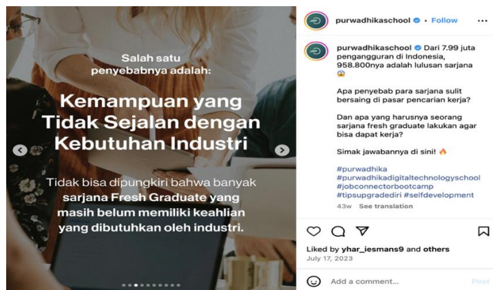
Figure 4. University Graduates Struggle to Find Jobs in Indonesia (Instagram @purwadhikaschool, 2023)